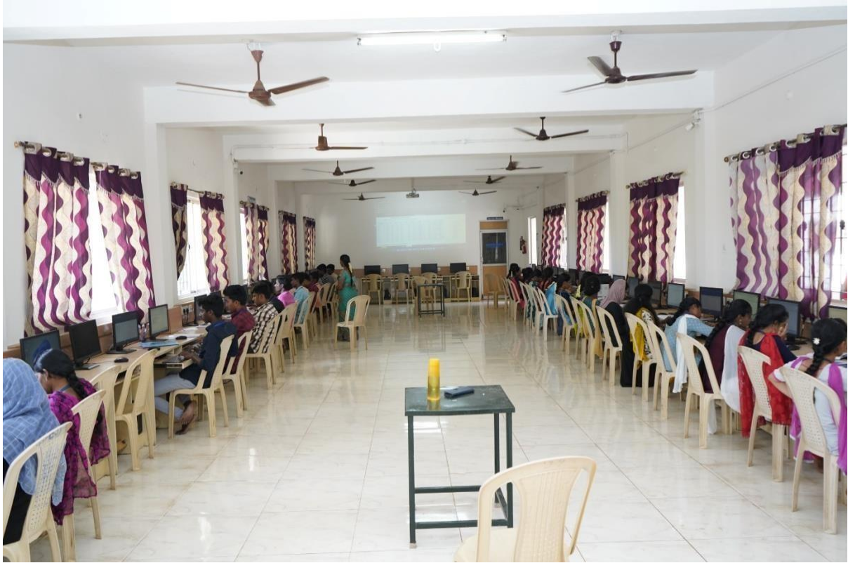
HANDS ON WORKSHOP WAS ORGANIZED ON FUNDAMENTALS OF EXCEL FOR SECOND YEAR BUSINESS ADMINISTRATION STUDENTS ON 11.03.2024