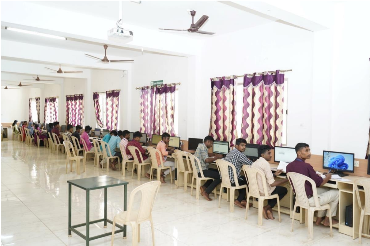
A HANDS ON WORKSHOP WAS ORGANIZED ON DATA ANALYSIS USING EXCEL FOR SECOND YEAR BUSINESS ADMINISTRATION STUDENTS ON 12.03.2024.