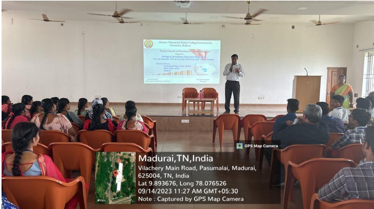
AWARENESS PROGRAM CONDUCTED ON INVESTMENT PATTERNS FOR SECOND AND THIRD YEAR BUSINESS ADMINISTRATION STUDENTS.