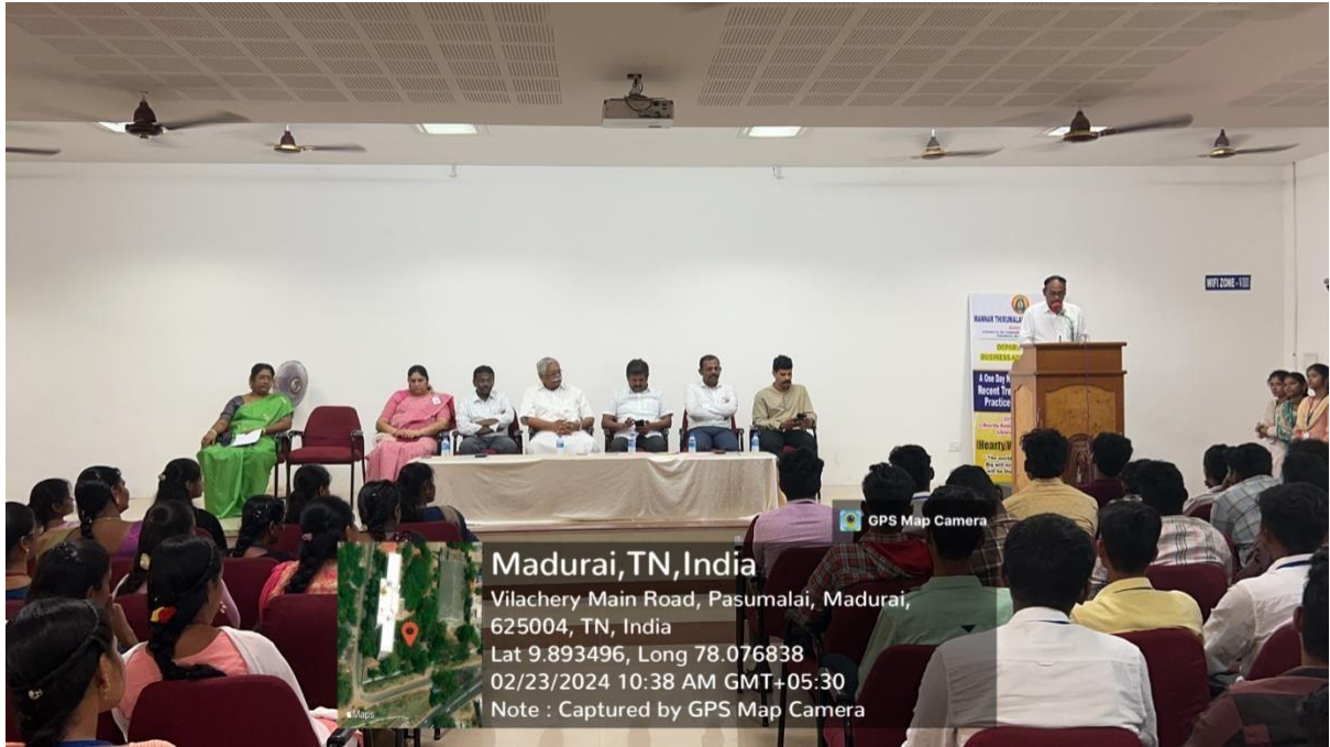
ONE DAY NATIONAL LEVEL CONFERENCE ORGANIZED ON RECENT TRANDS AND INNOVATIVE PRACTICES IN MANAGEMENT ON 23.02.2024.