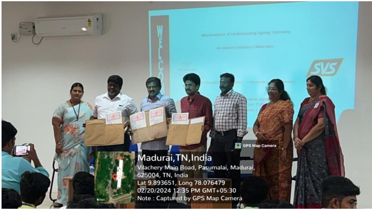
MOU SIGNING CEREMONY CONDUCTED ON 20.02.2024 WITH SVS FOODS AND RR AQUA FOR THE PURPOSE OF PROJECT, INTERNSHIP AND INDUSTRIAL VISIT.